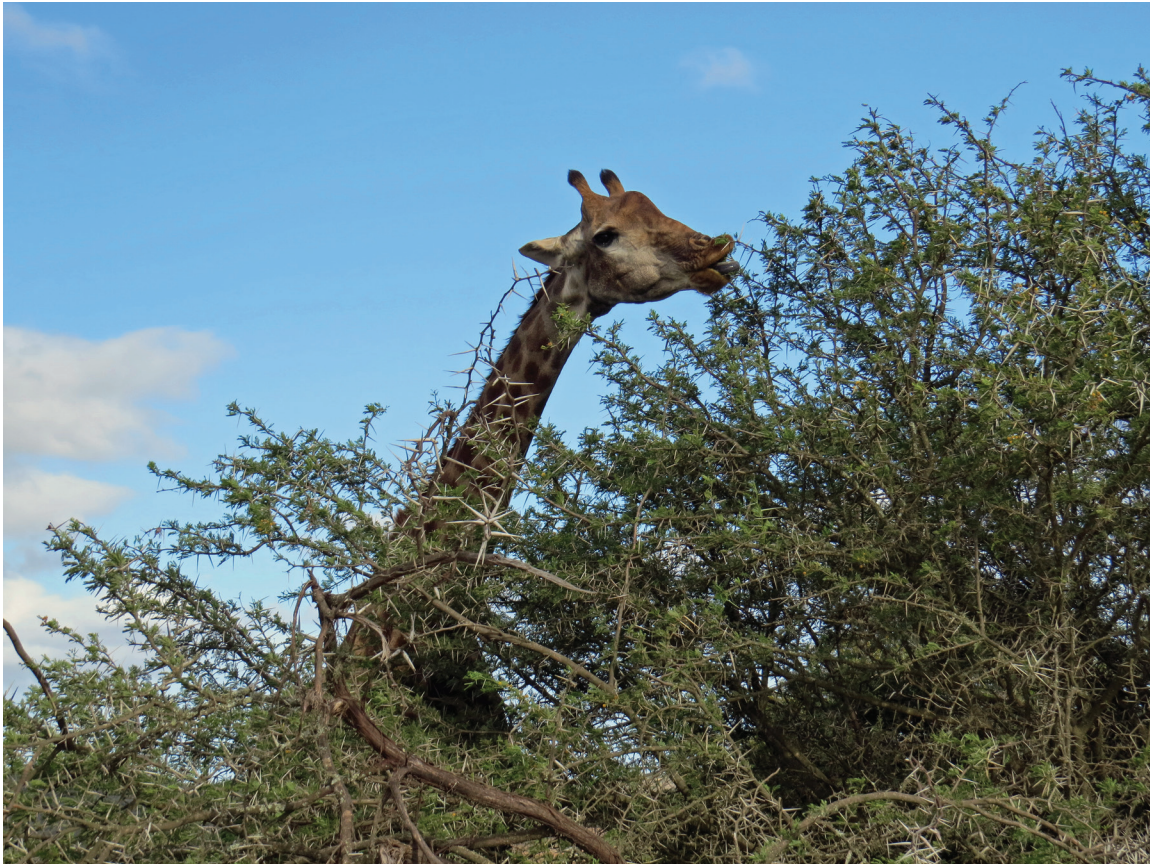
Fig. 4.2 for Question 4